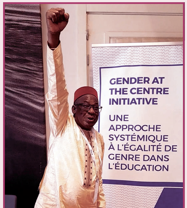
I am a Feminist Leader! - MoE official from Burkina Faso at a regional workshop on Gender-Transformative Leadership